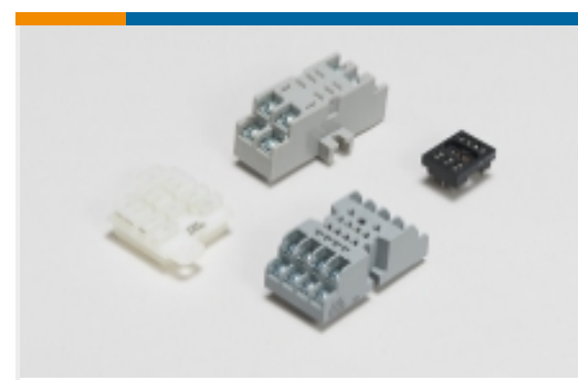
Relay Accessories, Sockets &amp; Clips(5)